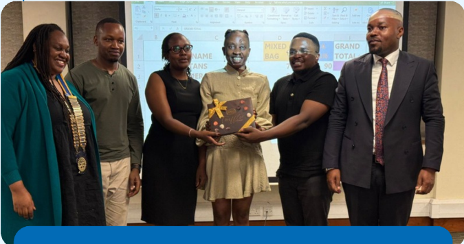
Winners of the peace quiz night