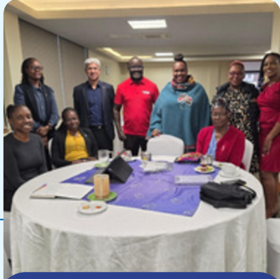
Hybrid Board meeting