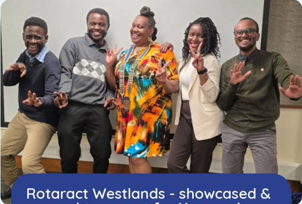
Rotaract Westlands - showcased & sought support for Korogocho Beadmaking project